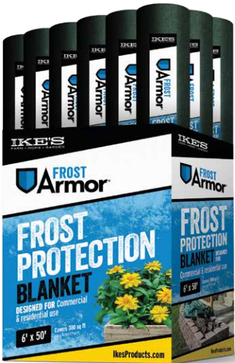
6' x 50' Blanket Sold in Case Pack