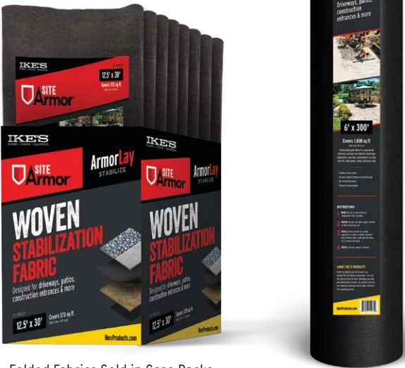
Folded Fabrics Sold in Case Packs

SIZES AVAILABLE Roll: 6' x 300' Folded: 12.5' x 30', 12.5' x 60'