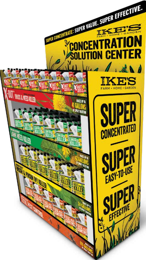
192-Count Solution Center Display