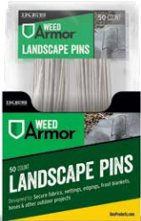
Sold in Case Pack