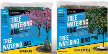
Sold in Case Packs