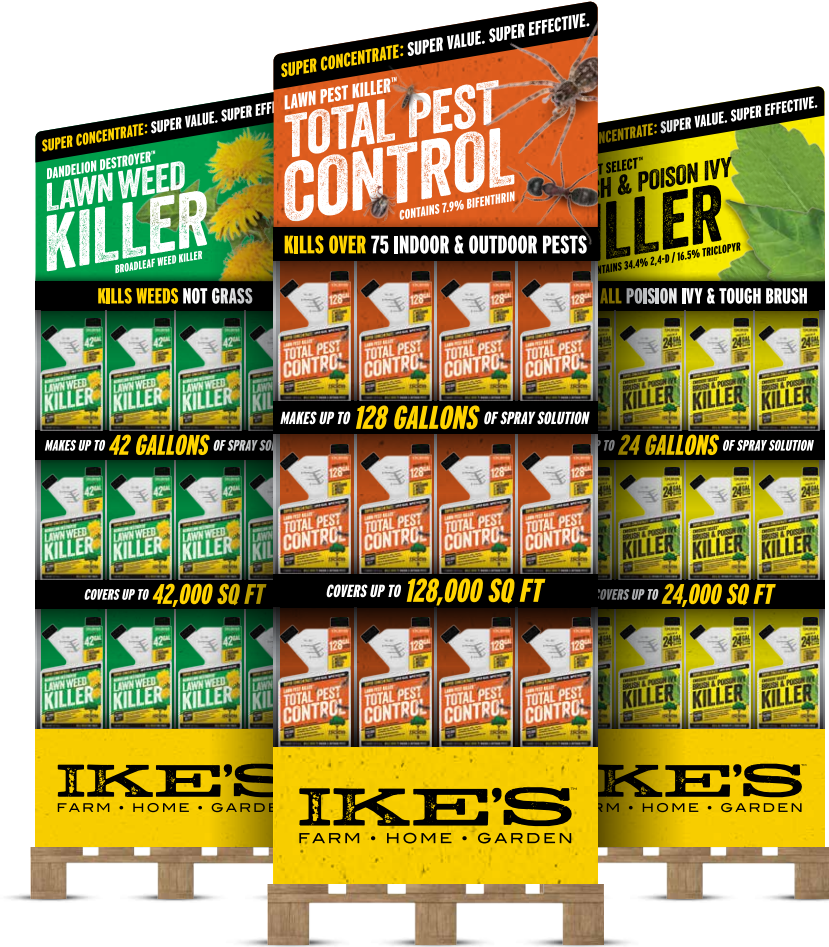
Product-Specific Displays available in 48-count and 72-count