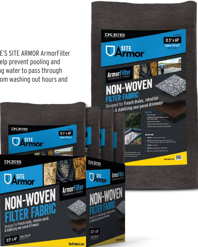
Sold in Case Pack