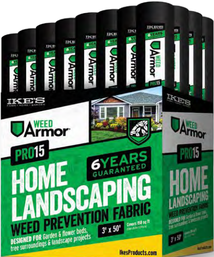
3' x 50' & 3' x 150' Sold in Case Packs