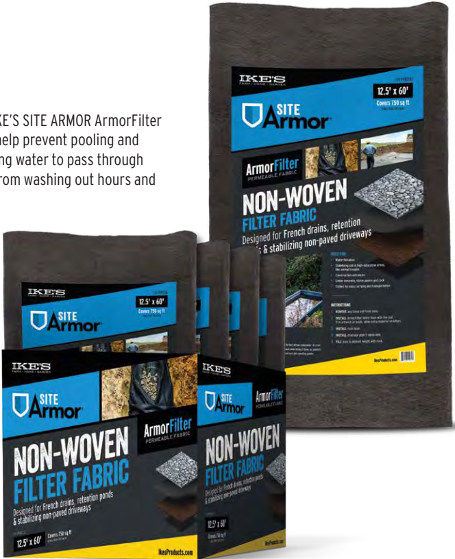
Sold in Case Packs