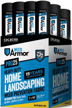
3' x 50' & 3' x 100' Sold in Case Packs