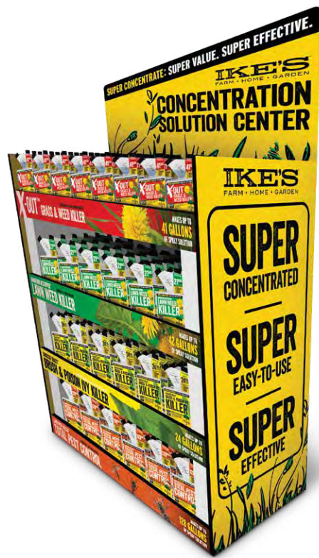
192-Count Solution Center Display