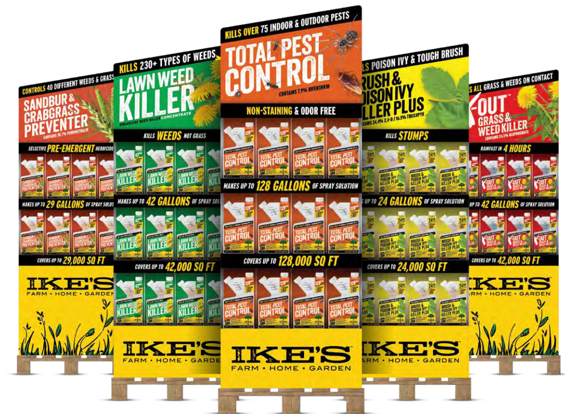
Product-Specific Displays available in 48-count and 72-count