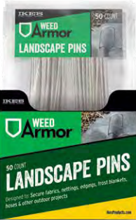
Sold in Case Packs