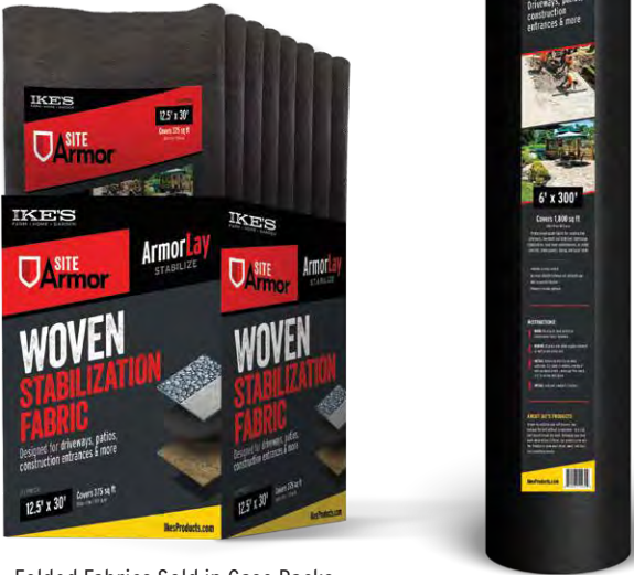
Folded Fabrics Sold in Case Packs

SIZES AVAILABLE Roll: 6' x 300' Folded: 12.5' x 30', 12.5' x 60'